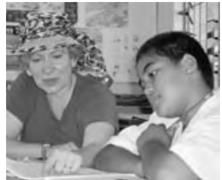
A Global Volunteers senior participating in a Cook Islands literacy project.